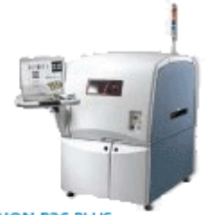
SYMBION P36 PLUS

Post -Paste AOI, True Offline Programming, Easy Gerber Import, 2D/3D Laser Path.